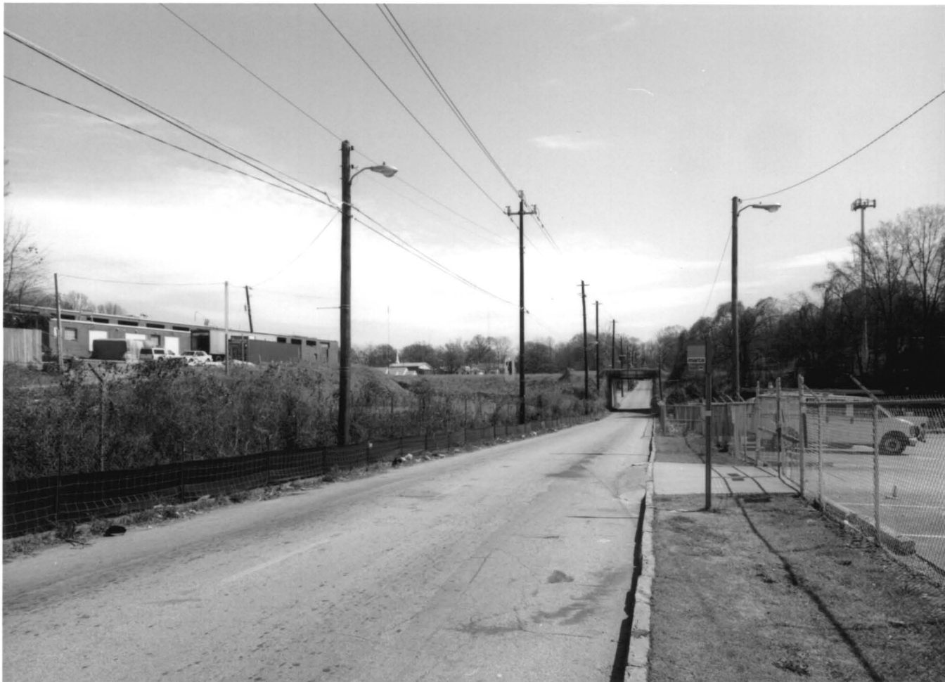
REYNOLDSTOWN HISTORIC DISTRICT FULTON COUNTY, GEORGIA