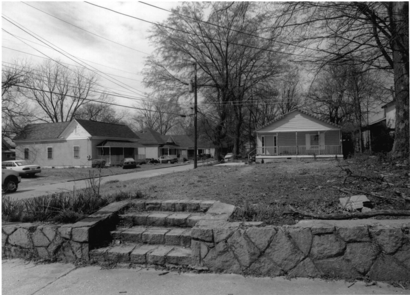
Reynoldstown Historic District Fulton County, Georgia 12/68