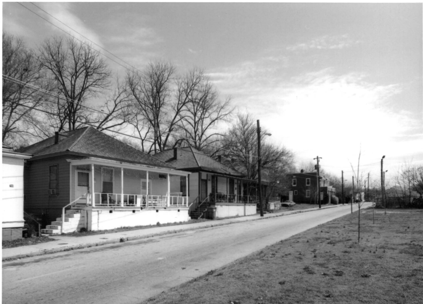
Reynoldstown Historic District Fulton County, Georgia