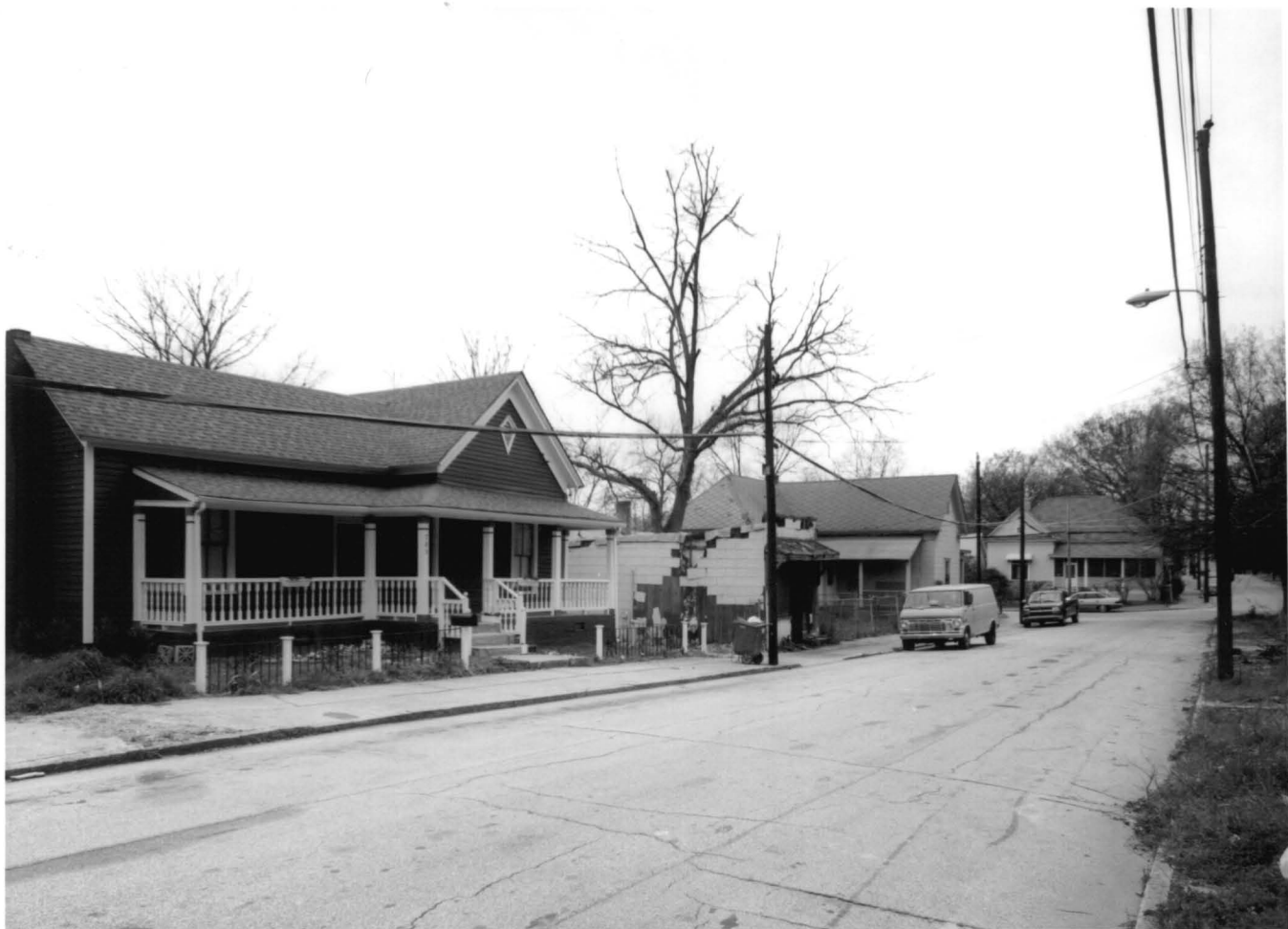
REYNOLDSTOWN HISTORIC DISTRICT FULTON COUNTY, GEORGIA