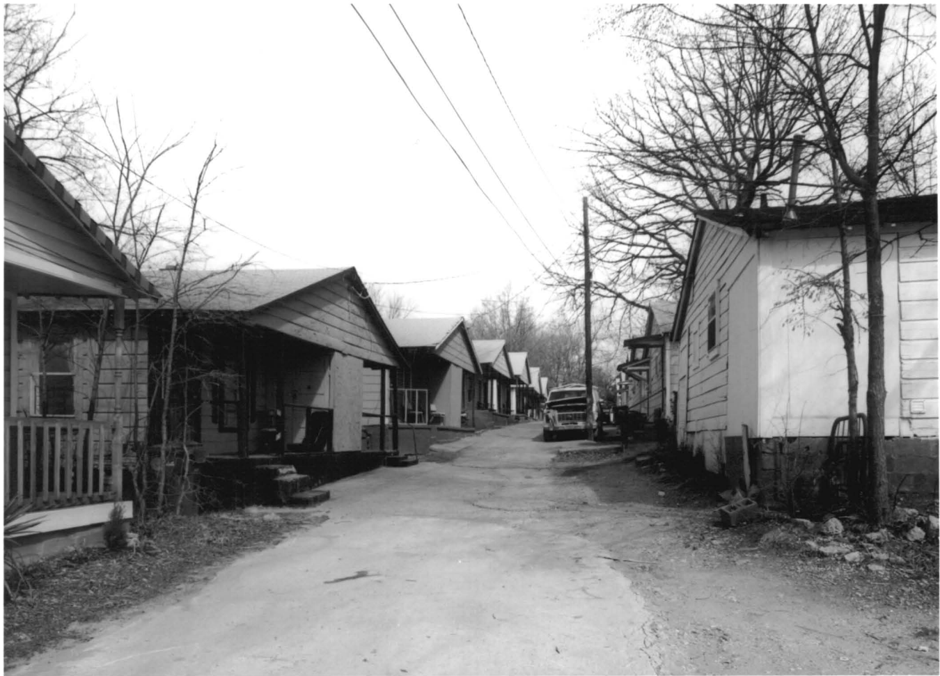
Reynoldstown Historic District Fulton county, Georgia